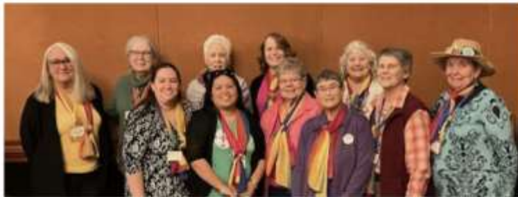
Seven Rivers District Attendees