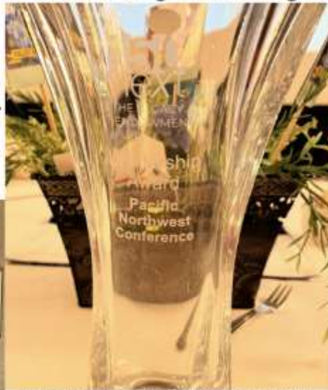
Crystal Vase presented to PNW Legacy Liaison for our outstanding contributions,

CONGRATULATIONS Seven Rivers was the highest donors in the Legacy Fund for the Pacific Northwest Conference!