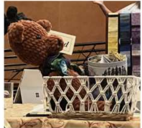
"Moose On the Loose" passed to each table for Legacy