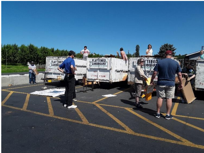
Recycling at Wesley UMC