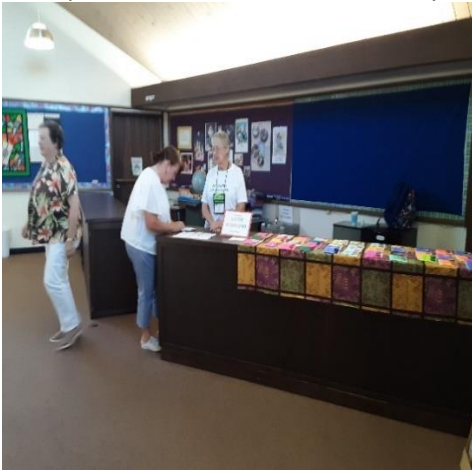
Love Ribbons for Sale