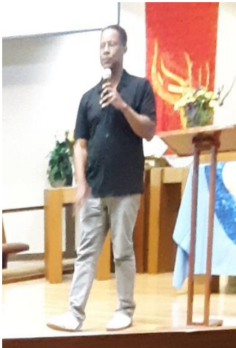
Bishop at Mission u