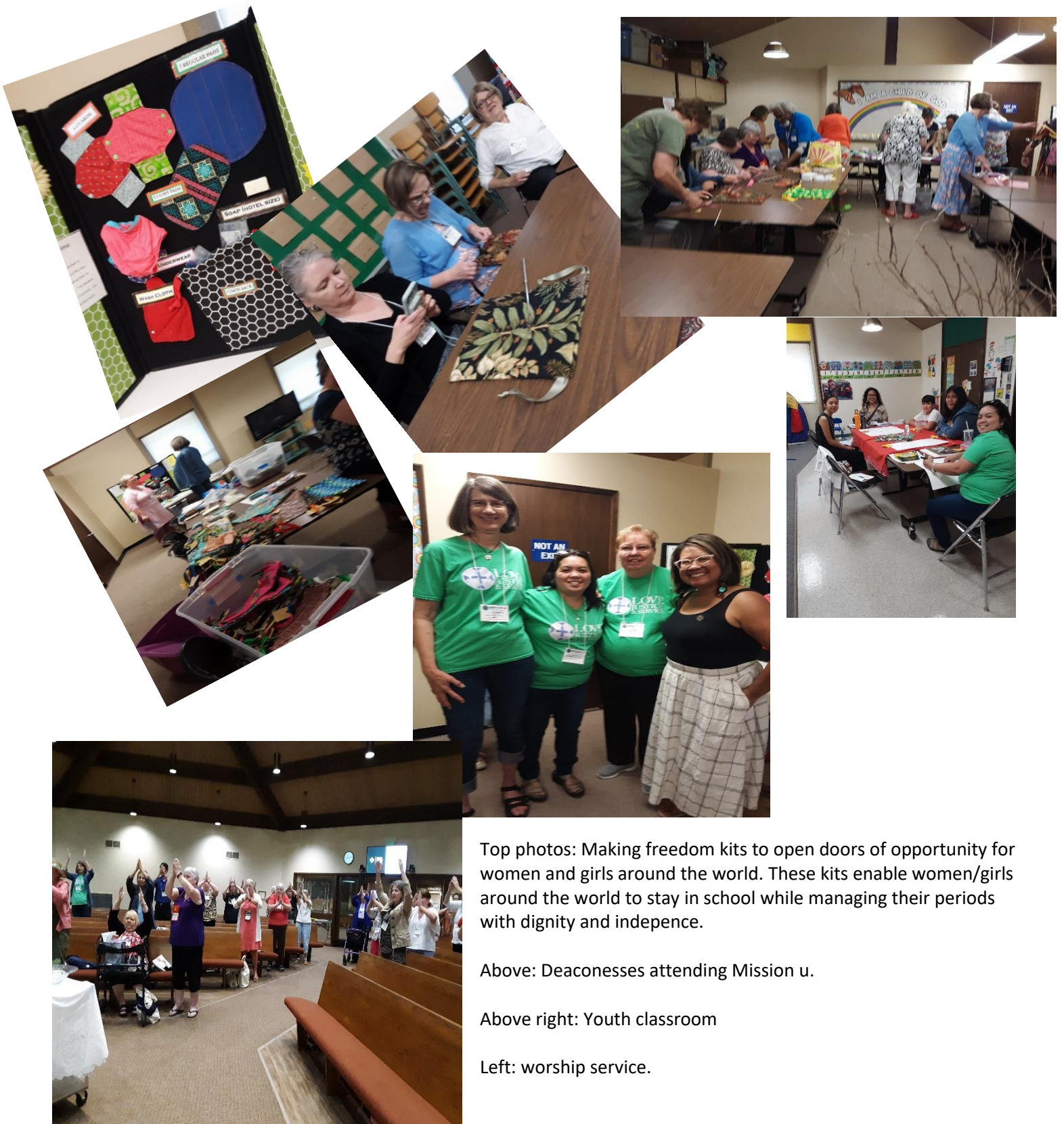
Top photos: Making freedom kits to open doors of opportunity for women and girls around the world. These kits enable women/girls around the world to stay in school while managing their periods with dignity and independence.