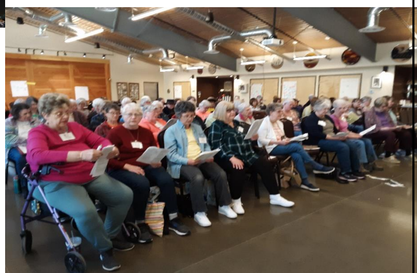
Enjoying "Celebrating Womanhood Workshop" Fellowship Time with Coffee and Conversation