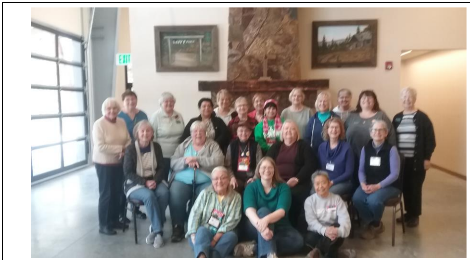
UNITED METHODIST WOMEN TEAM AT LAZY F