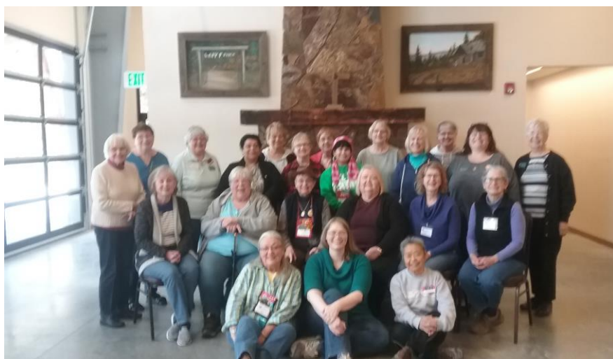
UNITED METHODIST WOMEN TEAM AT LAZY F