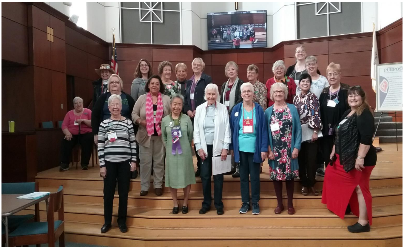
2018 – 2019 Pacific Northwest Conference United Methodist Women Officers