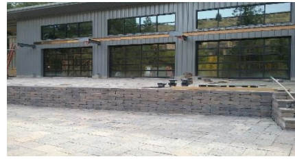
New Dining Hall at Lazy F Camp