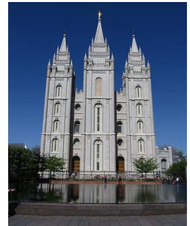
Salt Lake City Temple, by Ken Lund (via Flickr, used by Creative Commons License)

Tuesday evening we will have an opportunity to discuss issues and concerns relating to the 2016 General Conference , and the bigger picture regarding clergywomen in The United Methodist Church.